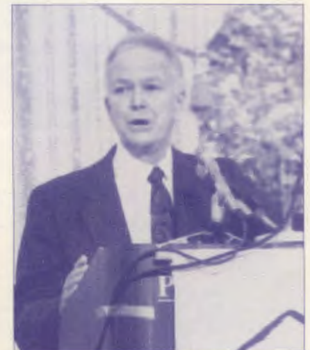
Senator Bob Packwood (R-Oregon) spoke to Queen's Bench at a breakfast on August 16, 1991.

The first step to success with investments is to know oneself—to determine one's investment profile, including personal goals and tolerance for risk. The other most important ingredients are good investment principles and the discipline to stay with a well-thought-out program. If a person has confidence and then experiences some success, it's easier to