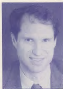
Rep. Ron Wyden

research (legislation which the President has attacked, point by point).